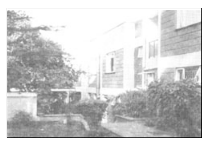
The Methodist Guest House in Nairobi will be the congenial setting for CONGRESS 96.

Each member association has been asked to designate two representatives to attend CONGRESS 96: one man and one woman. The associations must have paid dues for 1994 and 1995 before WOCATI will cover the expenses of the two representatives. The representatives will be the voting delegates for their associations and will bring responses from their respective associations to the three draft documents that appeared in the last three issues of WOCATI NEWS between February and May 1995 on the subjects of: (1) Academic Degrees and Credentials in Theological Education, (2) Theological Scholarship and Research, and (3) Women in Theological Education. The English abstracts of the three drafts are repeated in this issue of the newsletter on pages 5-7. French, Spanish, and Chinese translations of the abstracts are available in the earlier issues of the newsletter.