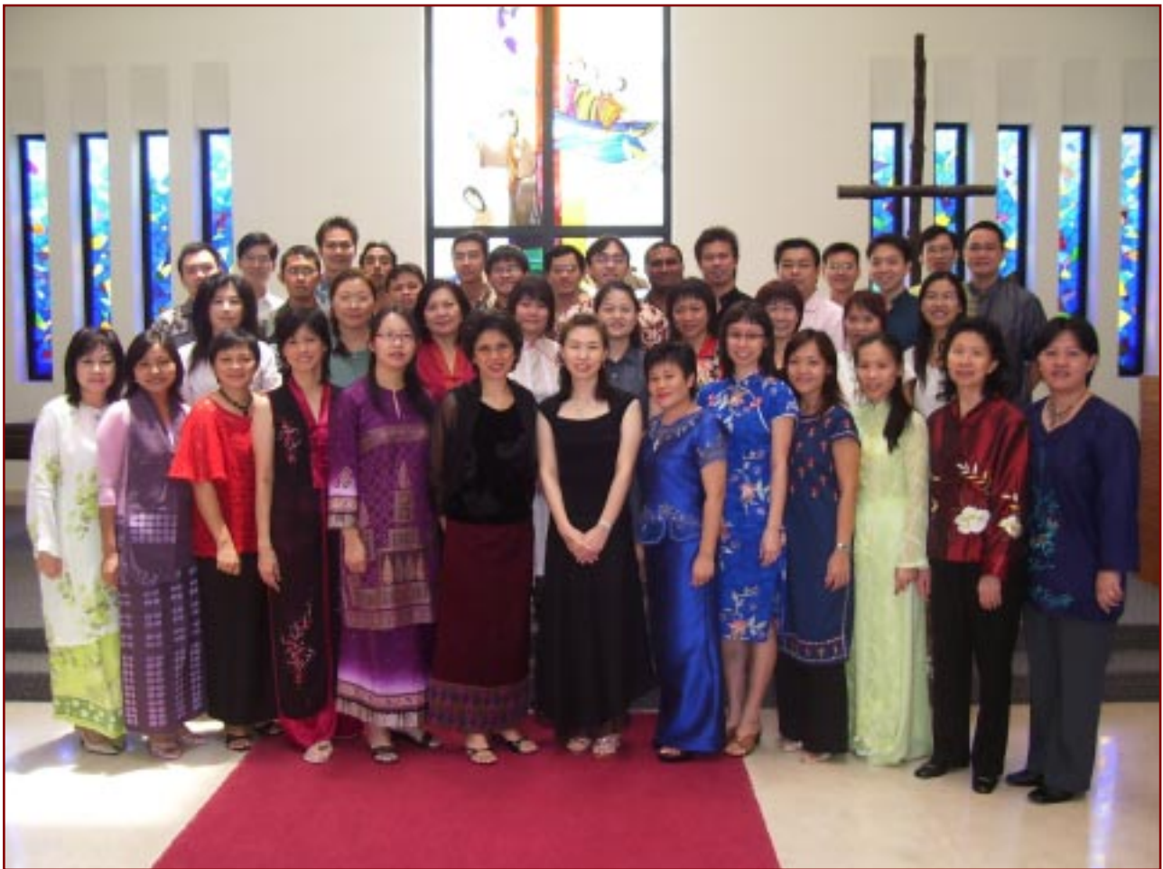
"Chorale of Trinity College of Singapore " ETE/WCC/Bossey Ecumenical Institute congratulates for the forthcoming celebrations of ATESEA Golden Jubilee Anniversary in Singapore Trinity Theological Seminary, November 26th-28th, 2007.