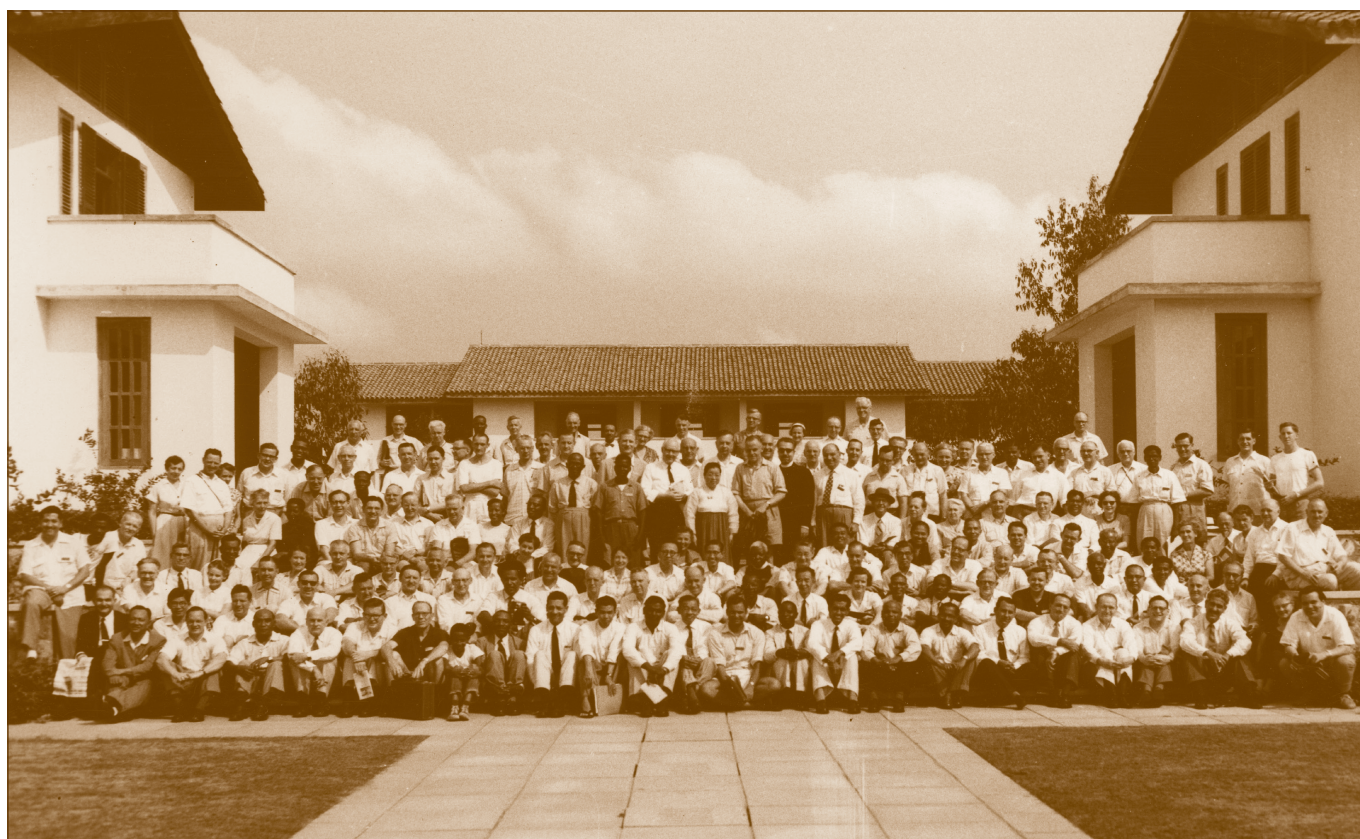
The founding of the Theological Education Fund (TEF)