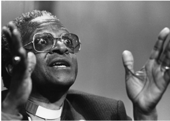
Desmond Tutu Archbishop Emeritus